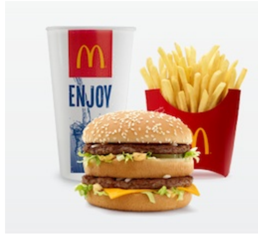
McDonalds serves three million meals a day

Along with the other companies already signed up to the pledge, including KFC, Pizza Hut, Pret a Manger and JD Wetherspoon, they will now begin to transform over 5,000 high street food outlets by end of the year.