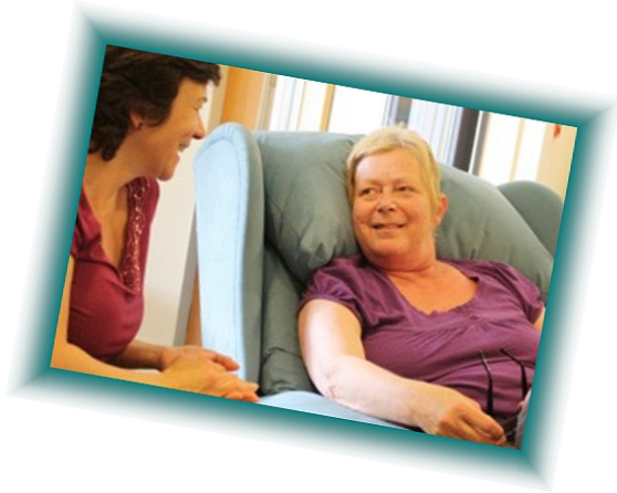
'Bringing together patients, carers and their communities'

In principal clinical commissioning groups will have a strong clinical focus which will bring together patients, carers and their communities. They will have robust governance requirements which are accountable to patients as well as arrangements for commissioning with other clinical commissioning groups, local authorities and the proposed NHS Commissioning Board.