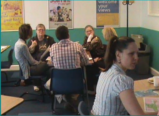
A workshop on mental wellbeing

We have been around the borough this month, outreach included a presence at the Catford South Local Assembly.