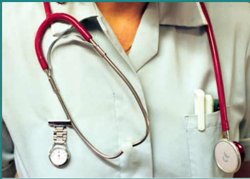
'Giving frontline clinicians greater freedom'

There are now more than 253 groups of GP practices across the country which have come forward to directly commission services, focused on delivering the best results for their patients. Once authorised as Clinical Commissioning Groups they will take on responsibility for health care budgets from April 2013.