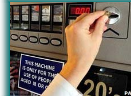
Children illegally obtain cigarettes from the machines

Nearly all adult smokers started smoking before they turned 18 and every year more than 300,000 under-16s try smoking for the first time. Of the 11 to 15-year olds who smoke regularly, 11% say they buy their cigarettes from vending machines.