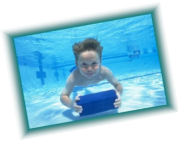
Taking the plunge for free in Lewisham!

Funding for the national free swim scheme was stopped in July 2010 but the Mayor of Lewisham decided that the Council would continue to run the programme until summer 2011.