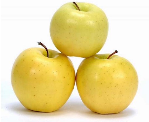
5,000 high street food outlets to be 'transformed'

“That is why this is such a great achievement by the Responsibility Deal. It will help people spot those hidden calories in their favourite foods and keep an eye on their waistlines.” ➔ More